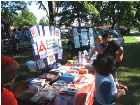
Visitor chooses an item displayed.

The 100 partnered with the Madison County Urban League Guild in promoting Healthy Awareness. The community event was the very successful Back to School – Stay In School Program held on Saturday, August 9, 2008, at James Killion Park at Salu. The groups joined tables and shared efforts to provide information about two illnesses that disproportionately affect African Americans, Diabetes and Prostate Cancer. Bottles of drinking water were distributed by both groups to help keep participants hydrated on the warm summer day.