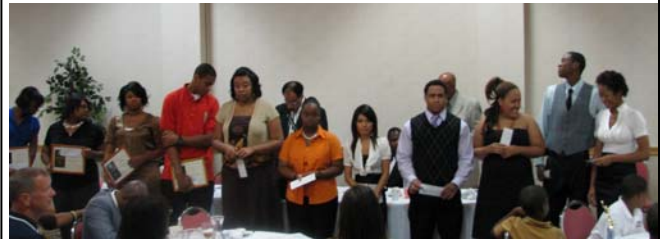
2008 Scholarship Awardees