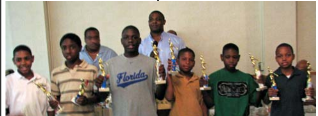
Some of the Future All Stars Basketball Awardees